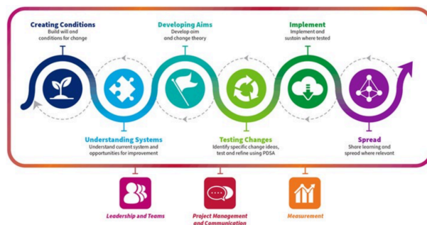
Quality Improvement Journey 4