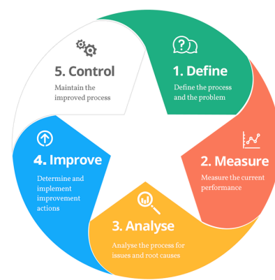
SIX SIGMA Method 6