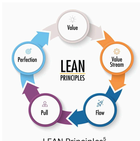
LEAN Principles 5