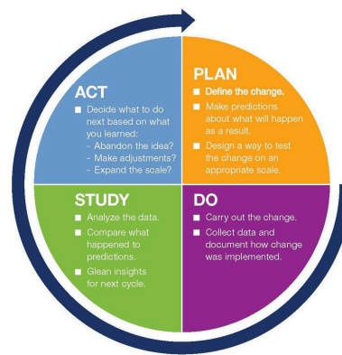
PDSA cycle 2