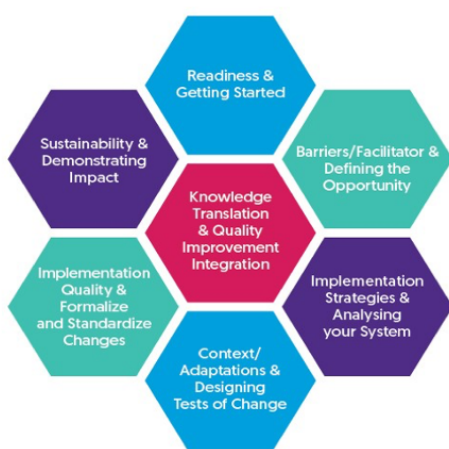
Knowledge Translation & QI Integration 3